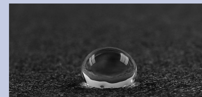
Surface of a Freudenberg GDL

Freudenberg's production process is fully integrated, from the fibrous raw material to the final product, guaranteeing consistent quality and performance. To ensure that our products meet the highest quality requirements, statistical process controls, fully automated camera-assisted inspections, in-line and off-site measurements are all standard procedures. Depending on the needs of our customers, we also offer a range of special GDL characterization methods either on request or for joint development projects. Regular internal and customer audits confirm the quality of our GDLs.